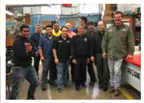
Instructors and participants pose for a group shot

OESP's mission of education has no clearer example than this annual competition